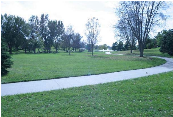
View of adjacent park from backyard